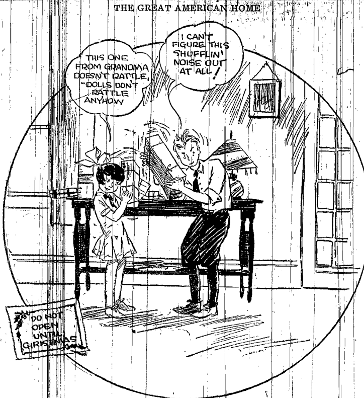
THE GREAT AMERICAN HOME